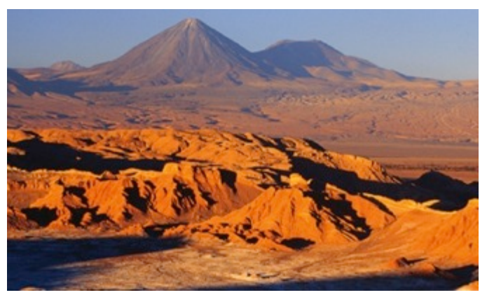
The Atacama Desert

Recent rains may prompt growth of the wonderful wildflowers. Interested travellers should contact us for details. October weather is good with temperatures from 8° overnight to 25° C.