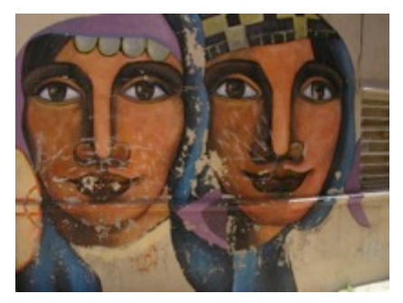
Street art, Valparaiso

We tour a splendid historic residence, the Quinta Vergara en route to Valparaíso – colonial port city – now a bohemian centre for arts and crafts. We take a funicular and view classy old 'English' houses, art galleries and artisan shops, lunch at Turri Restaurant with its great vista across the port, and then view street art by leading Chilean artists. Finally, we tour Neruda's La Sebastiana , with its idiosyncratic maritime collection. BL