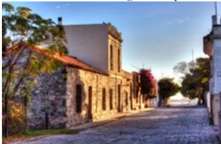
Colonia del Sacramento

At Puerto Madero we catch the catamaran ferry (1 hour) across the Rio de Plata to Colonia, Uruguay's oldest port settlement and subject to centuries of warring conflicts between Portugal and Spain.