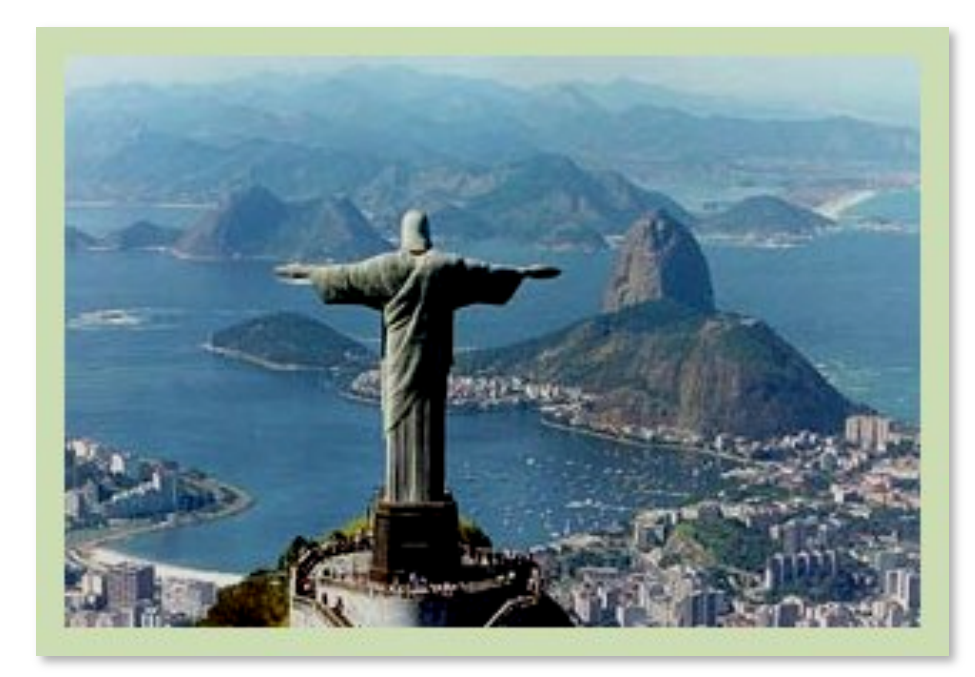
Rio de Janeiro from Corcovado Mountain

We head south to the Maipo Valley and Santa Rita, perhaps the most historic and beautiful vineyard estancia in Chile. It has excellent wines and by special arrangement, we tour the forty-hectare parkland leading to the old family mansion (now private hotel). The beautiful gardens, trees and buildings were constructed in the 1880's. The complex is enhanced by a lovely, modern museum. We enjoy a splendid lunch at Santa Rita and conclude our day back in Santiago with a farewell dinner at the Santiago German Club - which was established in 1838 and is a clear reminder of the German influence in Chile. BLD