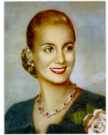
I will come again. I will be millions'. — Eva Peron ('Evita'). Indeed, millions did attend her funeral.

We tour Buenos Aires, the Paris of the South' , through tree lined avenues and historic buildings (some still bearing cannon damage from the revolution) and stop for coffee at Café Tortoni (1858) – haven for artists, politicians and intellectuals.