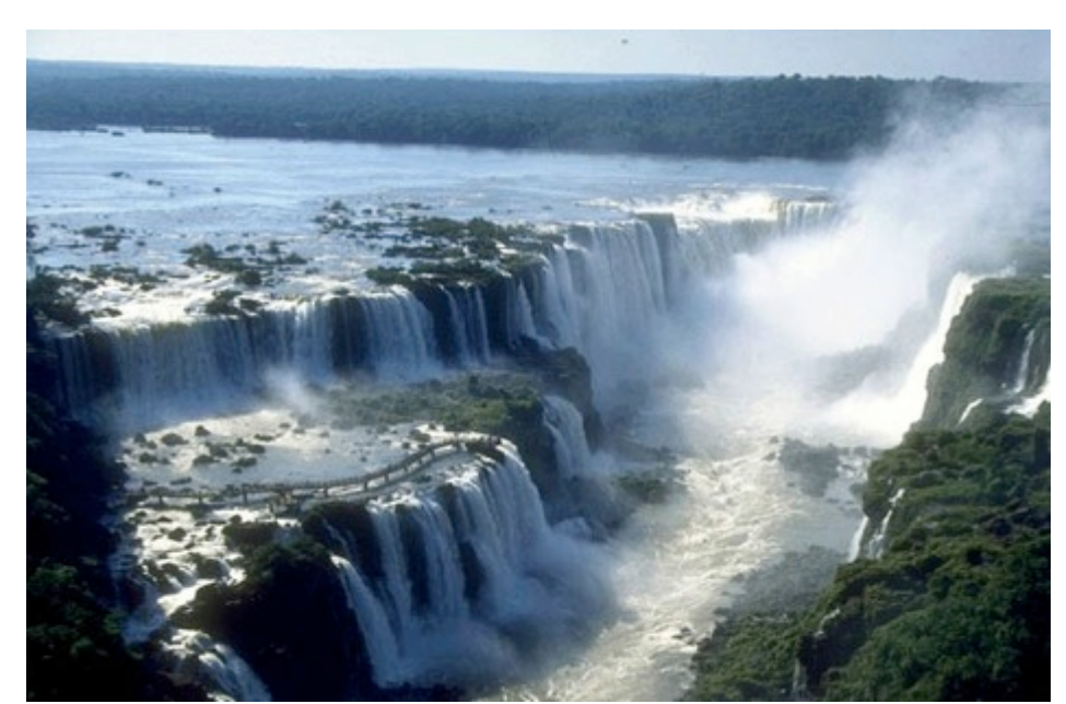
The amazing Iguazu Falls