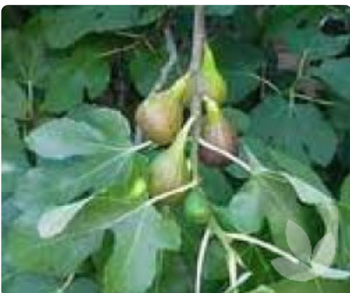
Ficus carica 'Brown Turkey' BROWN FIG, COMMON EDIBLE FIG

A fast growing, medium sized deciduous tree growing 3-5 metres tall. During summer, this variety produces masses of excellent quality, delicious dark red fleshed fruit with purple-green coloured skin. Self-pollinating and producing two crops per year, it is a reliable and heavy cropper with a vigorous spreading habit. This is a great variety for making jams, drying or eating fresh.