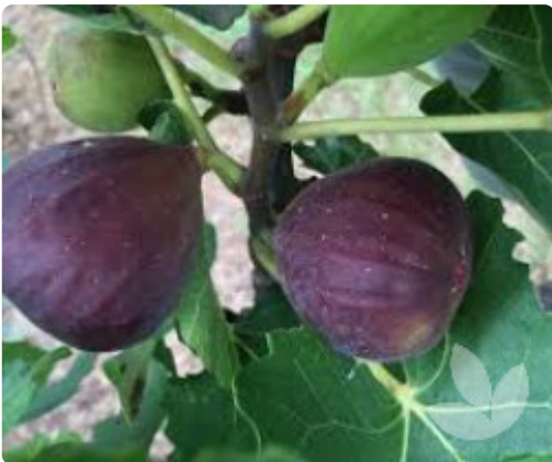
Ficus carica 'Black Genoa' BLACK FIG, COMMON EDIBLE FIG

This is a small evergreen fruiting tree to approximately 3m tall. It produces green-skinned fruit with a sweet, aromatic flavour, which taste like pineapple, apple and mint. As a tree, it has attractive leathery green leaves with silvery undersides and pinky-white flowers with large red stamens. Good as a contrast tree in the garden.