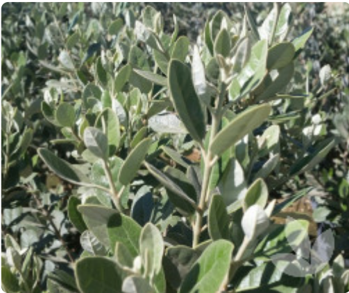
Acca sellowiana PINEAPPLE GUAVA, FEIJOA

There is something about a social challenge that makes us all review our lifestyle going forward. Being somewhat closer to nature and self-sufficient is a nice feeling. While not a big part of what we do, our advanced edible and fruiting trees offer a ready-made solution.